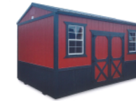
Side Utility Shed