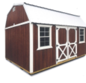
Side Lofted Barn & Lofted Side Utility